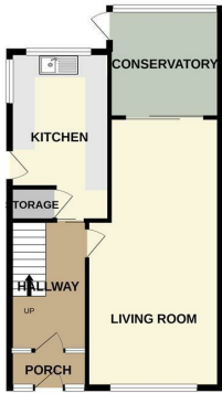
GROUND FLOOR 602 sq.ft. (55.9 sq.m.) approx.