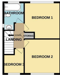
1ST FLOOR 444 sq.ft. (41.2 sq.m.) approx.